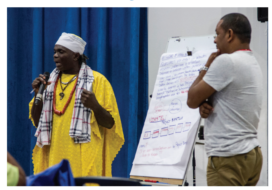
As part of the consultation process, a joint workshopfor indigenous village leaders and Maroon tribal leaders followed two days of separate meetings with the leaders in October.

In Suriname, WISE REDD+ supported a series of consultations in collaboration with VIDS (Associations of Indigenous Village Leaders in Suriname) & VSG (Association of Saramaka Authorities) with the objective to optimize the inclusion and participation of indigenous and tribal peoples in REDD+ readiness. The consultations, which were interactive and participant-driven, took approximately six months, and included site visits to more than 50 villages. The consultations involved two phases: the first, a series of meetings with representatives of several villages; the second, through krutus (tribal councils) in the villages. The design of the second phase was based on the finding that consultations with traditional authorities and providing direct access to information for communities was critical to incorporating recommendations into decision-making. Feedback from participants has indicated that they are satisfied with the consultation process, particularly with the inclusion of indigenous and