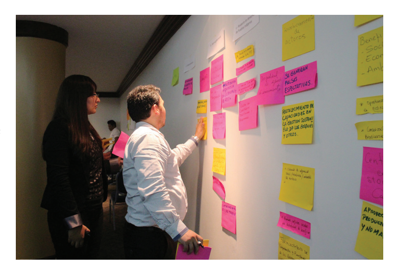
The March safeguards worshop was part of a series of activities identified by MINAM for building Peru's Safeguard Information System.

In March 2015, MINAM convened a safeguards capacity building workshop with the support of CI-Peru. This workshop was focused on strengthening the capacity of stakeholders prioritized by MINAM, including representatives from the regions of Madre de Dios, Ucayali, Loreto, and San Martin; representatives of public institutions, such as the National Forest Authority, Ministry of Culture, Ministry of Development and Social Inclusion, Prime Minister's Office; representatives of indigenous peoples, including AIDESEP; and regional indigenous federations of San Martin (CODEPISAM) and Madre de Dios (FENAMAD); and representatives of civil society organizations, including the National Farmer Federation (one of the highland agricultural community organizations). Additionally, Helvetas has provided technical support for CORPIAA's meetings in Atalaya to strengthen capacity on REDD+ issues.