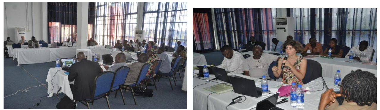
Plate 2.4 b. Multi-stakeholder MRV capacity building session

Overall some progress has been made in the implementation of this sub-component. Capacities for relevant stakeholders have been enhanced at both federal and national level through a series of technical capacity building workshops, including: (i) a forest monitoring and MRV workshop for 49 stakeholders in 2014; (ii) a National Forest Carbon Inventory training with 25 participants in 2014; (iii) capacity building on image processing and interpretation of satellite imagery of 20 staff; (iv) a forest carbon inventory data analysis training of 26 staff, and (v) a Greenhouse Gas Inventory training of 23 staff from the LULUCF sector. These trainings and workshops, plus the establishment of technical Working Groups, advance efforts for the NFMS to be put in place in the future. Sampling design is based on a 2014 land use map produced with the help of the Nigerian National Space Research and Development Agency (NASRDA), which will be used as the framework to establish a Forest Monitoring System at Cross River State (CRS) by the end of 2016. In addition, the technical Working Group on MRV activities is in the process of acquiring recent satellite data to advance subsequent monitoring activities. Nigeria also participated in the CNA for West Africa and is included in the joint support to West Africa for strengthening regional capacity in West Africa for national forest carbon inventories.