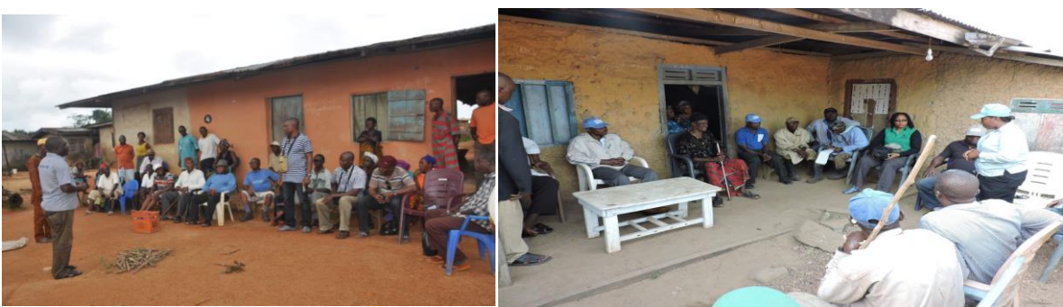
Plate 2. 1. REDD Team during community consultation and engagement