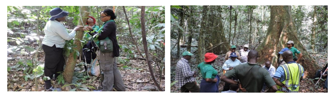
Plate 2.4 a. Gender-inclusive and Participatory MRV Field Measurements

Eighty sample plots have been established in about 62 local communities to estimate carbon stocks and Emission Factors, updated MRV database for CRS, including historic & real-time remote-sensing put in place. Forest Carbon Inventory (FCI) Standard Operation Manual has been prepared, produced and printed. The GHG inventory component of the MRV system has determined forest carbon stock change in CRS and consequently will allow the verification of the national GHG inventory.