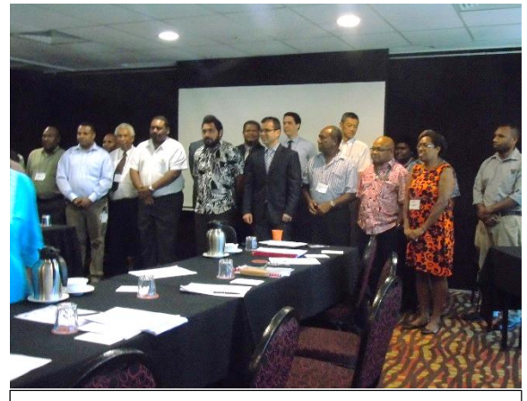
FCPF Inception Workshop, 25 March 2015