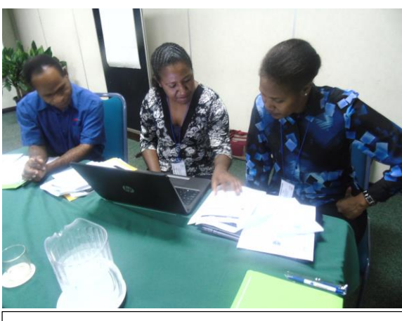
Work Group Discussions, November 2015