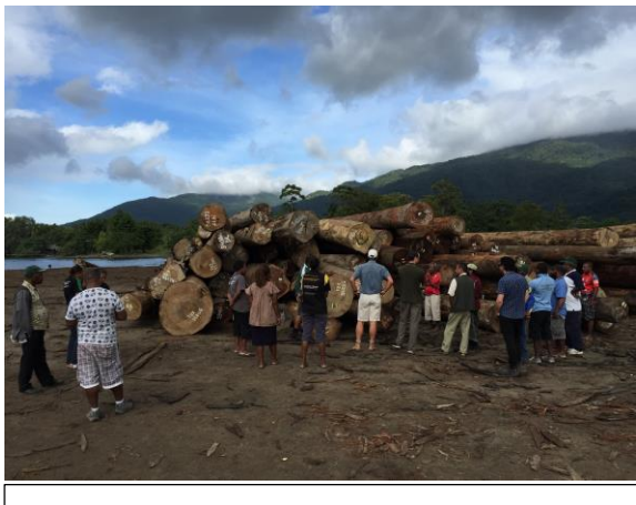
Field visit, Alotau, June 2015