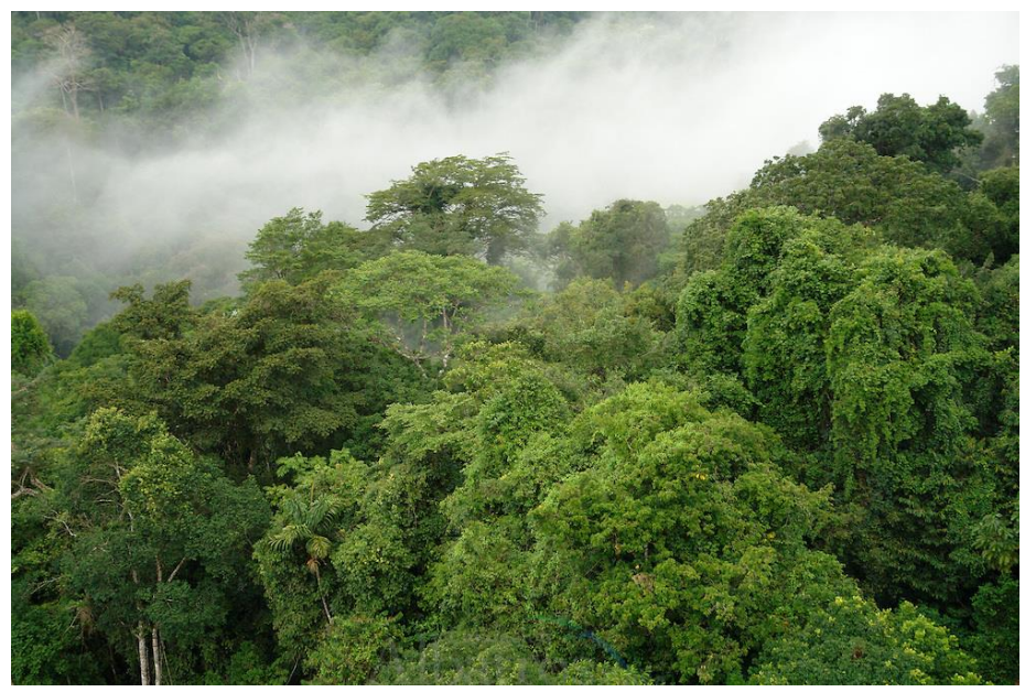
Chagres National Park. Panama.