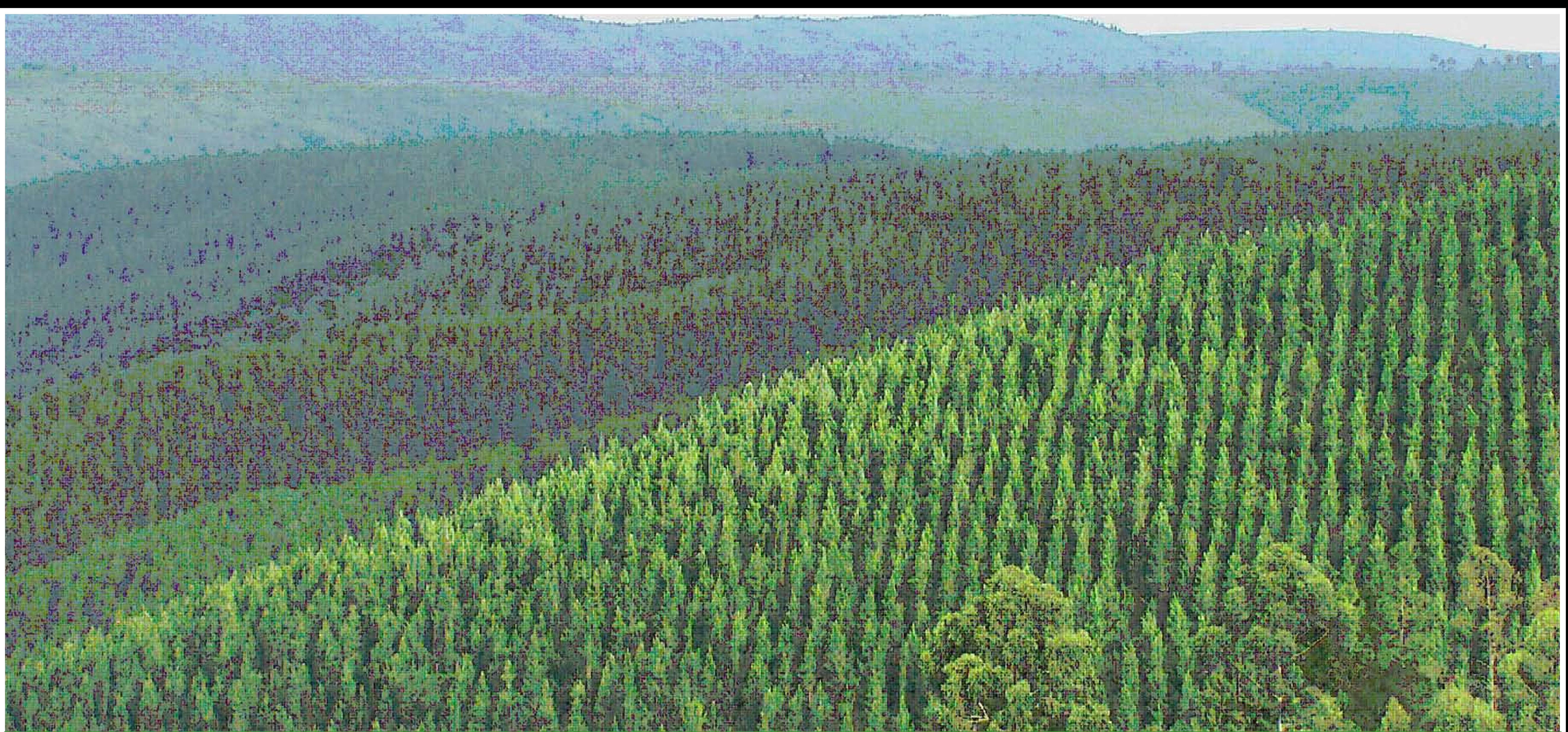
Extraction of utilisable forest resources from plantations to reduce pressure on natural forests

Globally, REDD+ means REDUCING EMISSIONS FROM DEFORESTATION AND FOREST DEGRADATION , the role of Conservation, Sustainable Management of Forests and Enhancement of Forest Carbon stocks in Developing Countries.