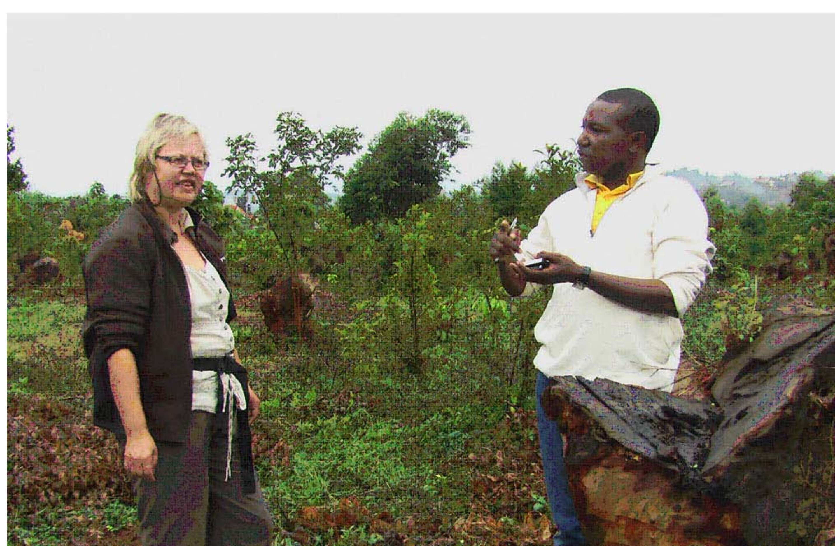
Kajansi central forest reserve (CFR) is one of the peri urban CFRS under pressure for forest products