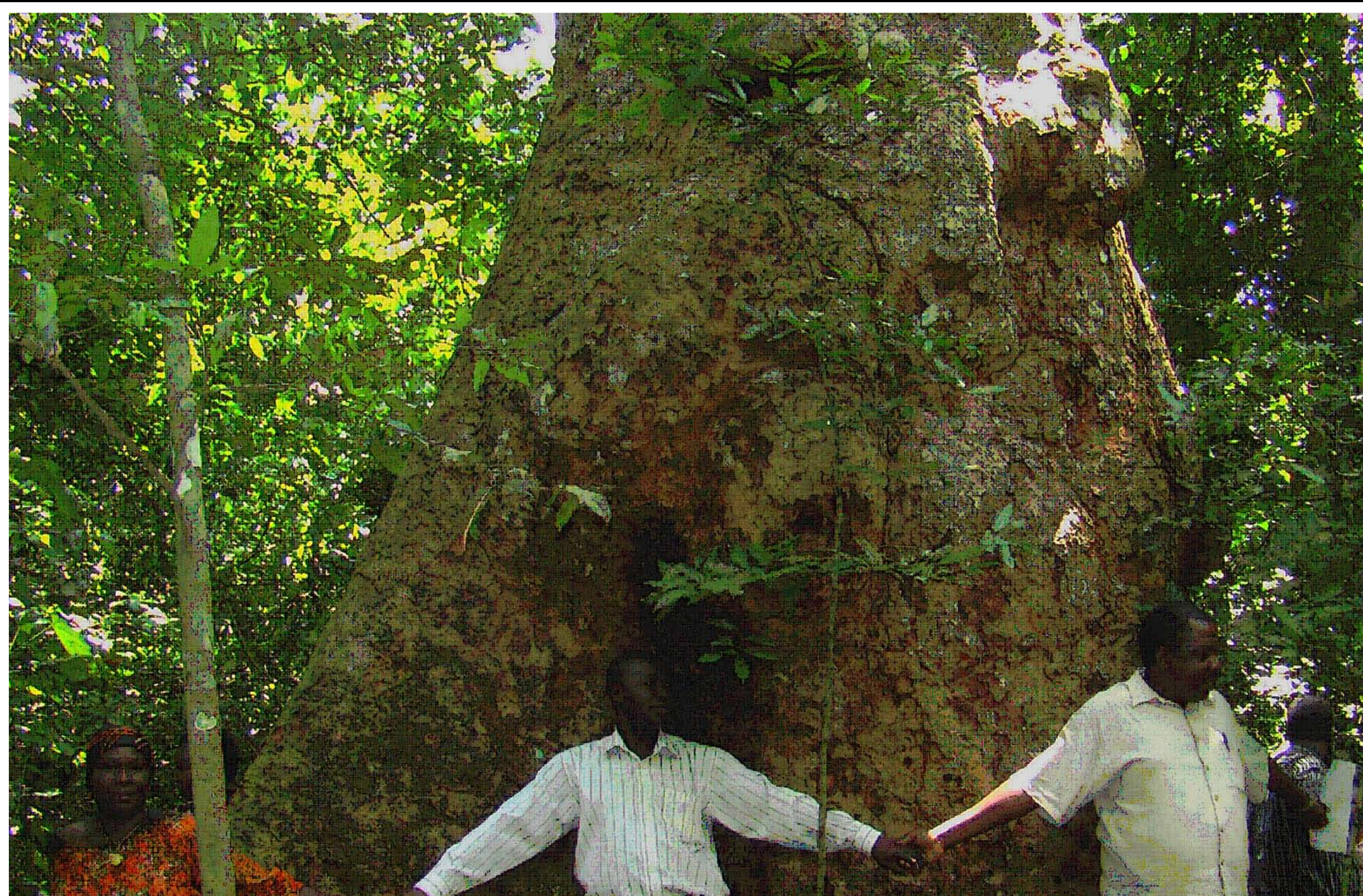
Members of Parliament pause around the oldest tree in Budongo central forest reserve