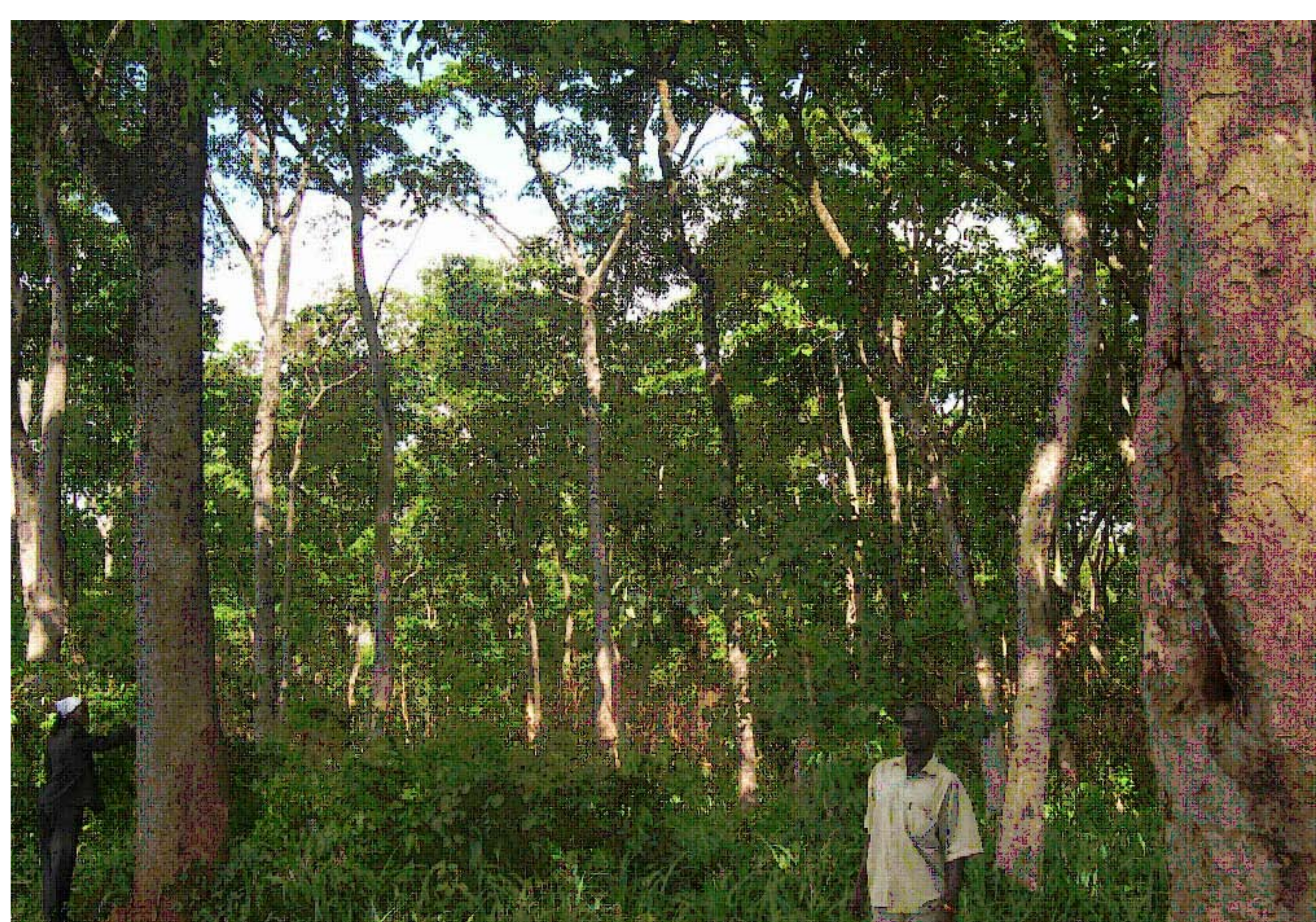
Private tree farmers will benefit a lot from REDD+