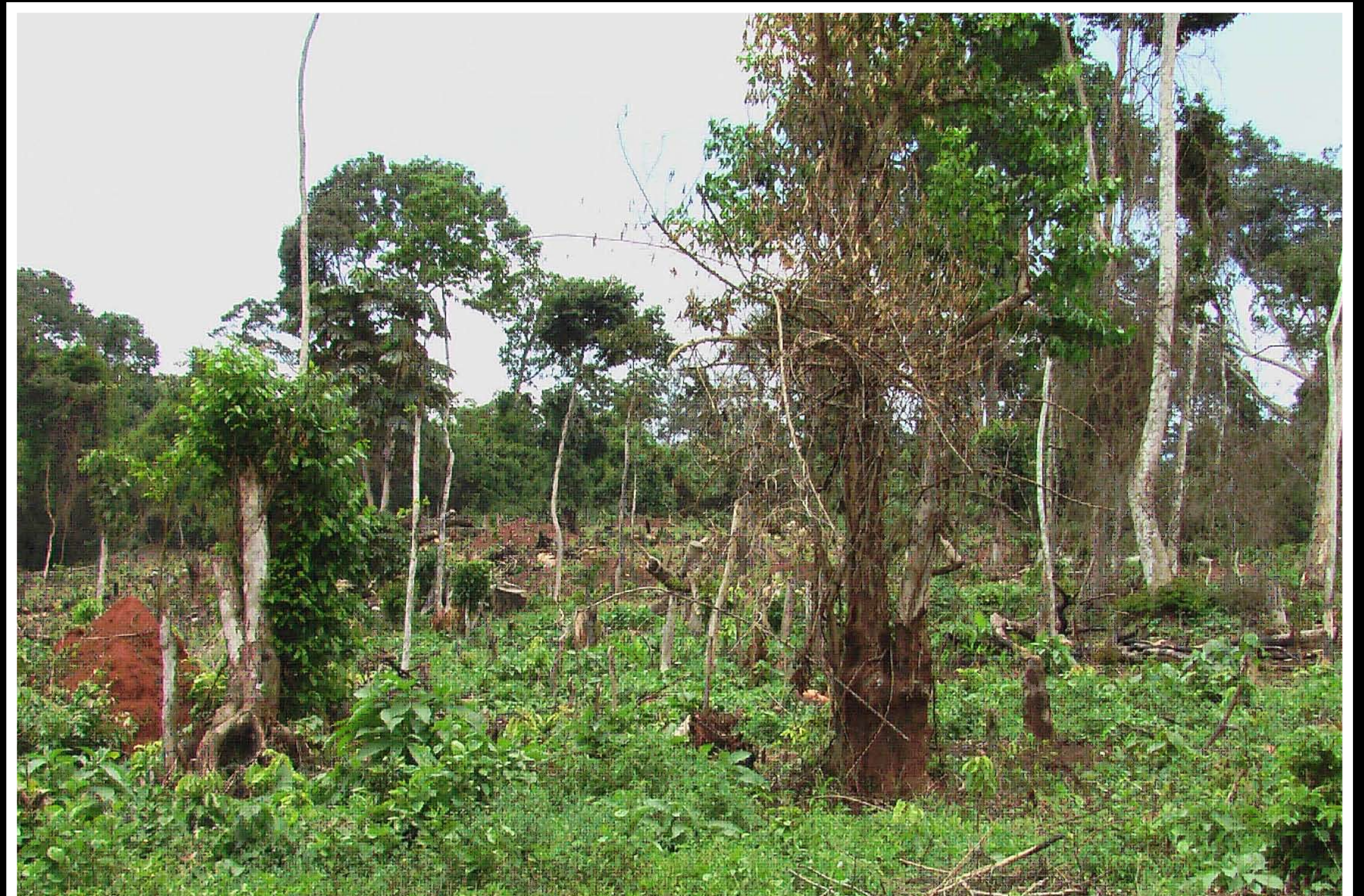
Deforestation and forest Degradation remains a challenge in protected areas and on private land